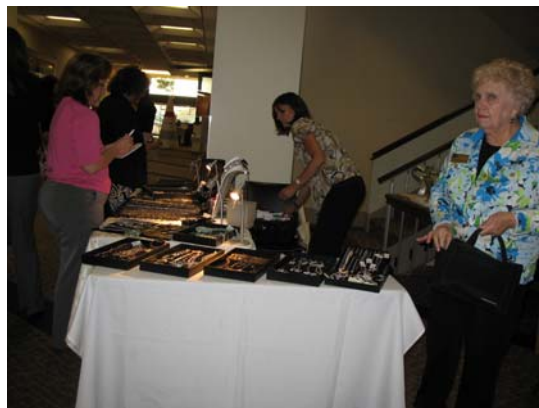
The Cookie Lee display was a favorite of the meeting attendees.