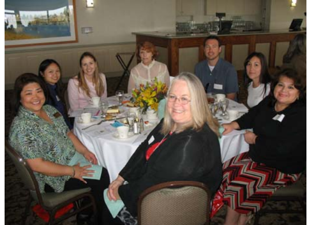
Another successful luncheon!