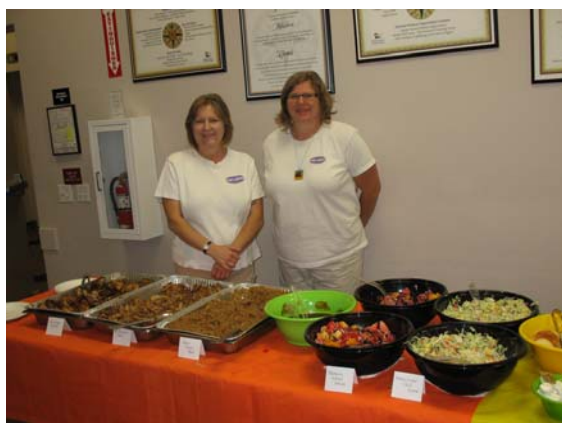
Catering was provided by Party Express