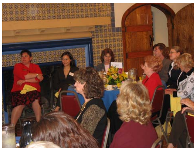
Attendees enjoy both the lunch and the speaker.